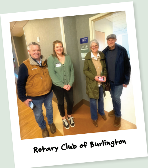
Rotary Club of Burlington