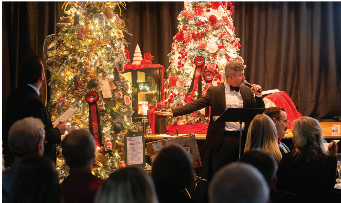
■ These are among 26 spectacular trees handcrafted by local designers that raised over half a million dollars at the Foundation's 37th annual Festival of Trees in November 2025.